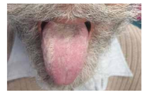
Figure 2. Photograph showing a white film on the tongue of the patient – oral leucoplakia.

His family includes two brothers who had no skin pigmentation or nail dystrophy. He has two children, one son and one daughter. Presently they also have no symptoms suggestive of dyskeratosis congenita.